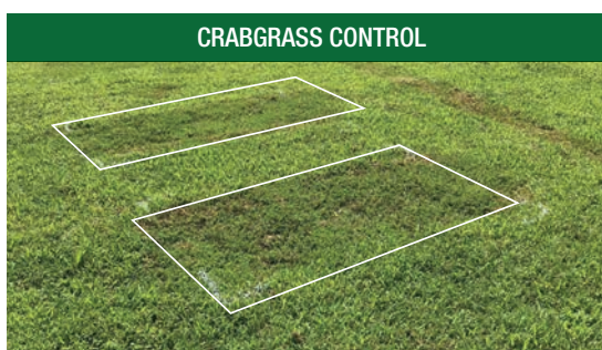
Square plots of crabgrass were treated with two spot treatments of Manuscript at 0.96 fl. oz./gal. and Adigor™ surfactant at 0.64 fl. oz./gal., 13 days apart.

*For optimal dallisgrass control, apply Manuscript during the spring or fall when grassy weeds are more susceptible to herbicides.