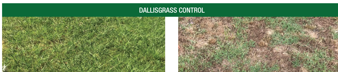
Left image: untreated dallisgrass. Right image: dallisgrass 10 days after one treatment of Manuscript at 0.96 fl. oz./gal. and Adigor at 0.64 fl. oz./gal.