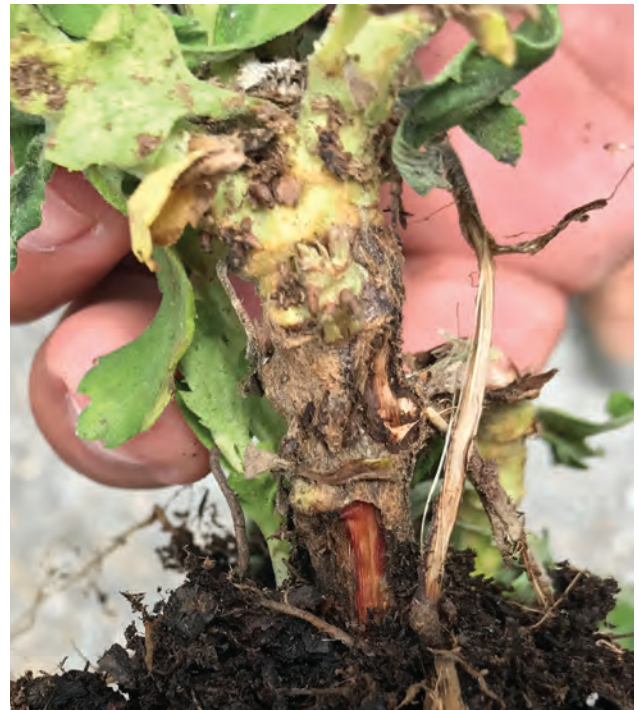
Internal vascular discoloration Syngenta