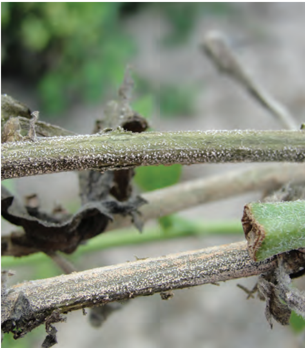
Fusarium sporodochia Syngenta