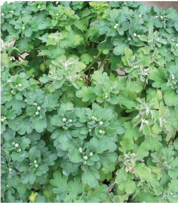
Fusarium , early stages Syngenta