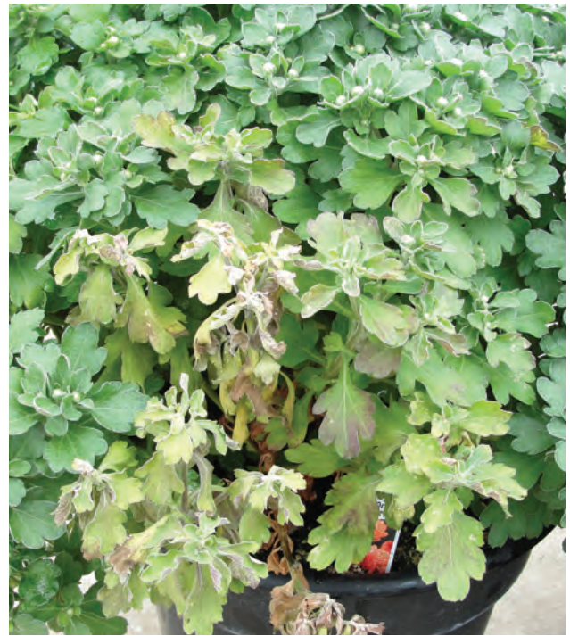
Fusarium , late stages Syngenta