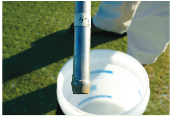
Using a soil probe, sample to the current depth of the root system.