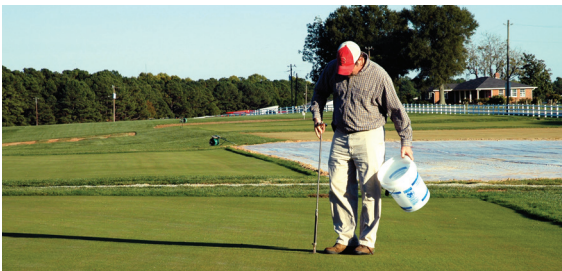
For more efficient sampling, collect cores from the same area of the golf course in a bucket.