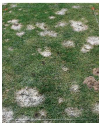
Interface® 4.0 fl oz + Mirage™ 1.4 fl oz