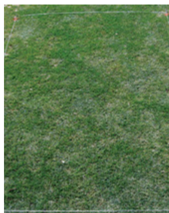
Contend A 1 fl oz + Contend B 2.6 fl oz

3 FRAC codes. 4 active ingredients. 110 days of control. That's the power in Contend. Use it to protect fairways from snow mold. Bank on it for performance. Contend is comprised of Contend A and Contend B and must be tank mixed together to ensure control.