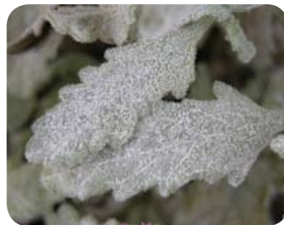
Powdery Mildew on Verbena