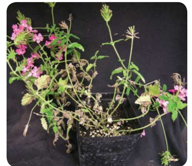
Powdery Mildew on Verbena

Keep the growing environment dry. Reduce relative humidity by venting and heating as needed. High humidity occurs at the leaf surface when cold nights change to warm days or when plants are grown in crowded or shady locations without good air movement.