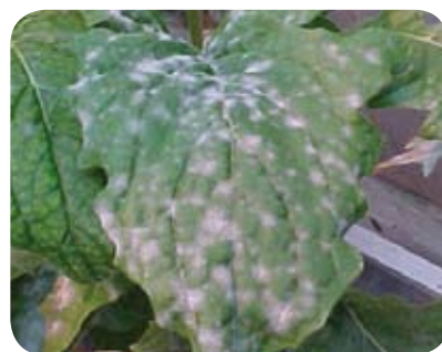
Powdery Mildew on Gerbera