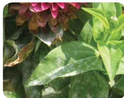
Powdery Mildew on Zinnia

A commonly occurring powdery mildew fungus, Erysiphe cichoracearum , infects many plants including: