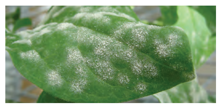
Powdery mildew on petunia