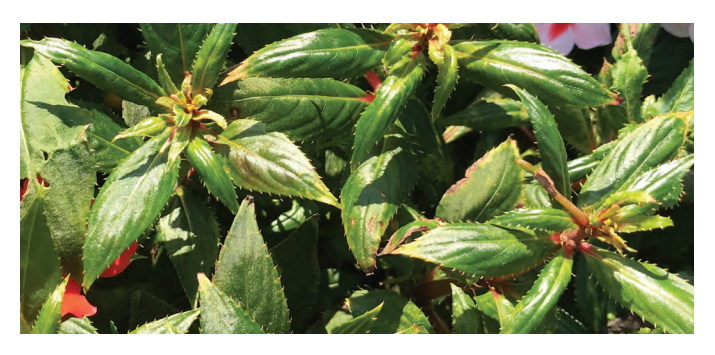
Broad mite damage on New Guinea impatiens