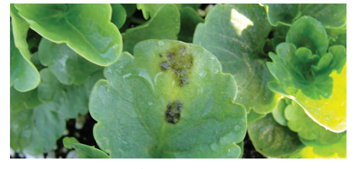
Early Cercospora leaf spot on pansy

All photos taken by Nancy Rechcigl, Syngenta