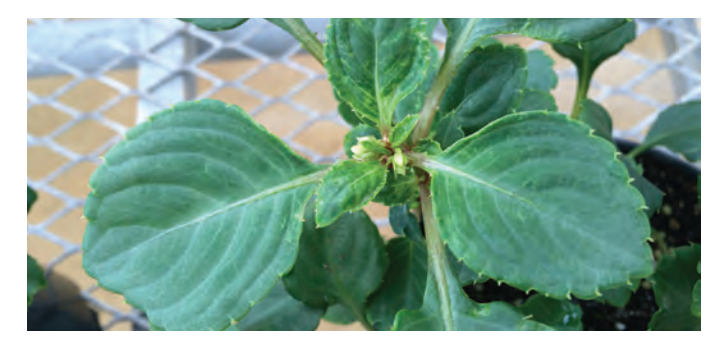
Thrips injury on impatiens

Although many insects and diseases can affect spring production, powdery mildew and thrips are two of the most common. Scouting is necessary to limit development and reduce symptoms in the greenhouse. Management practices, such as inspecting all incoming plant material, can prevent insects or diseases from establishing.