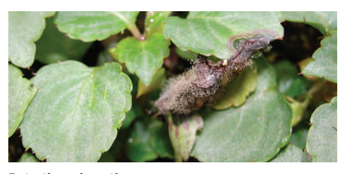
Botrytis on impatiens