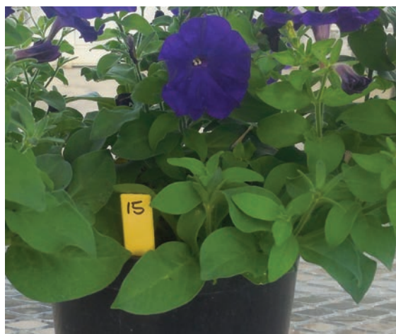
2 oz. drench – 24 days after inoculation 2014, Vero Beach Research Center, Syngenta.