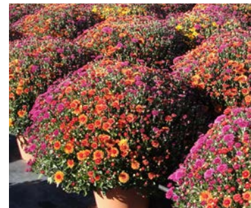
Use Medallion WDG in rotation with Mural to protect mums from Fusarium and other serious diseases.

Medallion WDG is an excellent rotation partner with Mural™ fungicide (FRAC 11 & 7) to protect crops from key foliar, crown, stem and root diseases.