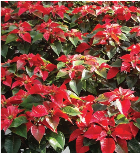
Medallion WDG protects plants so growers can market clean, high-quality crops.

Medallion® WDG fungicide delivers reliable, broad-spectrum control of major foliar, root and stem diseases at low use rates. As the only fungicide in its chemical class (FRAC 12) growers trust Medallion as an essential part of their disease management program.