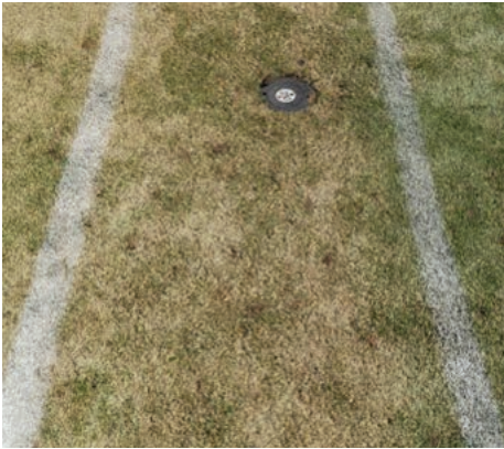
Untreated Check Primary pathogen: T. ishikariensis Gray snow mold, 120 days snow cover