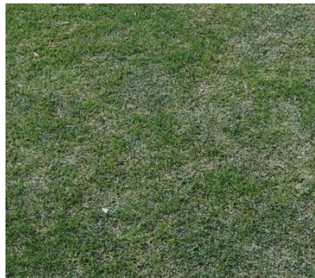
Contend A 1 fl. oz. + Contend B 2.6 fl. oz. / 1,000 ft 2