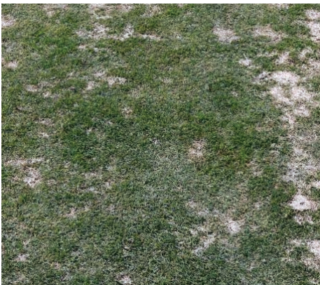
Concert ® II fungicide 8.3 oz. + Banner Maxx ® fungicide 1 oz. / 1,000 ft 2

Professional Turfgrass Solutions, A. Van Dyke, Park City, UT 150 Days Snow Cover, Fairway Kentucky Bluegrass, Poa annua