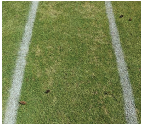
Contend 1 fl. oz. Contend A + 2.6 fl. oz. Contend B / 1,000 ft 2