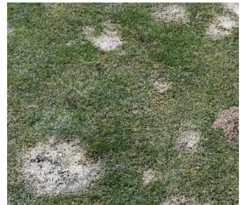
Interface fungicide 4.0 fl. oz. + Mirage ® fungicide 1.4 fl. oz. / 1,000 ft 2

Contact your local Syngenta Territory Manager online at GreenCastOnline.com/ContactUs .