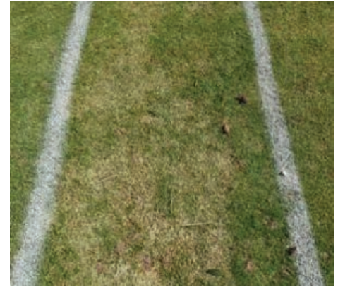
Interface ® fungicide 4.0 fl. oz. + Triton ® FLO fungicide 0.55 fl. oz. / 1,000 ft 2